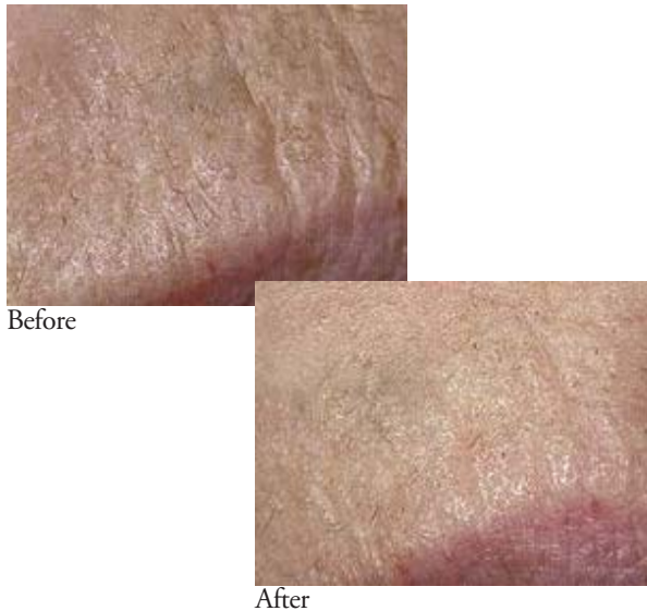
Upper lip area after 5 treatments.

Laser Skin Rejuvenation For Wrinkles & Acne Scars